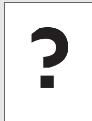
2004 To be announced June 17 at the TBA Convention